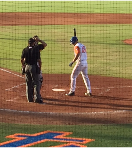
LOCAL STAR TIM TEBOW